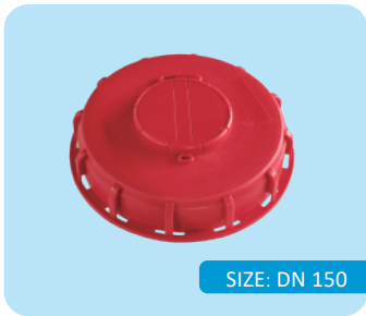
SIZE: DN 150