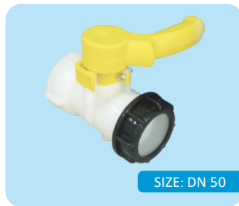
SIZE: DN 50

HDPE extrusion blowing container suitable for many different liquids storage and transport. The surface of container make trough type for reinforcement it and durable.